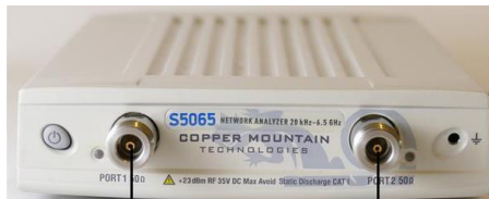
Copper Mountain VNA S5065

A known 1 mΩ resistor measured using 2-port shunt-through impedance measurements using the Copper Mountain S5065. The J2102B removes the ground loop error in 2 port shunt-through impedance measurements.