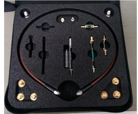
P21B01 PDN Probe Bundle and DC Blocks (2-Port Probe shown)