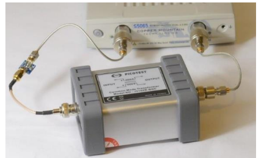
2-Port Shunt-Through test setup using the Copper Mountain S5065 and the J2102B-BNC