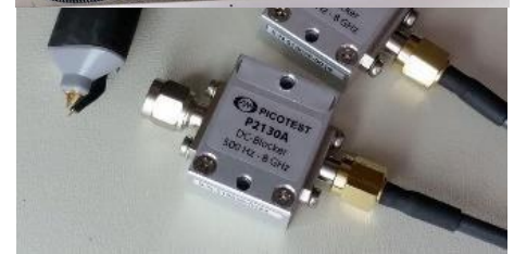
PCK01 High Performance Cable and Connector Kit

Picotest provides products that are designed to simplify measurements while providing the ultimate resolution and fidelity.