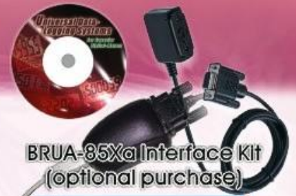
BRUA-85Xa Interface Kit (optional purchase)