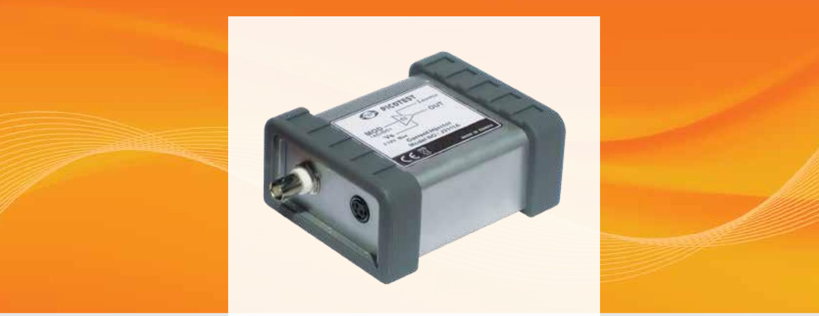
Product specifications are subject to change without notice.

The J2111A Current Injector is the most versatile tool in the Picotest Signal Injector product line. Coupled with the G5100A AWG, or other equivalent function generator, it is capable of performing small-signal load steps up to 40MHz, with up to 20ns rise/fall times. Rise and fall times can be controlled and arbitrary waveforms can be used to drive the injector producing load current profiles of virtually any characteristic pattern. This is ideal for emulating all types of load conditions, including high speed digital circuit loading, battery discharge profiles, or spontaneous current spikes.